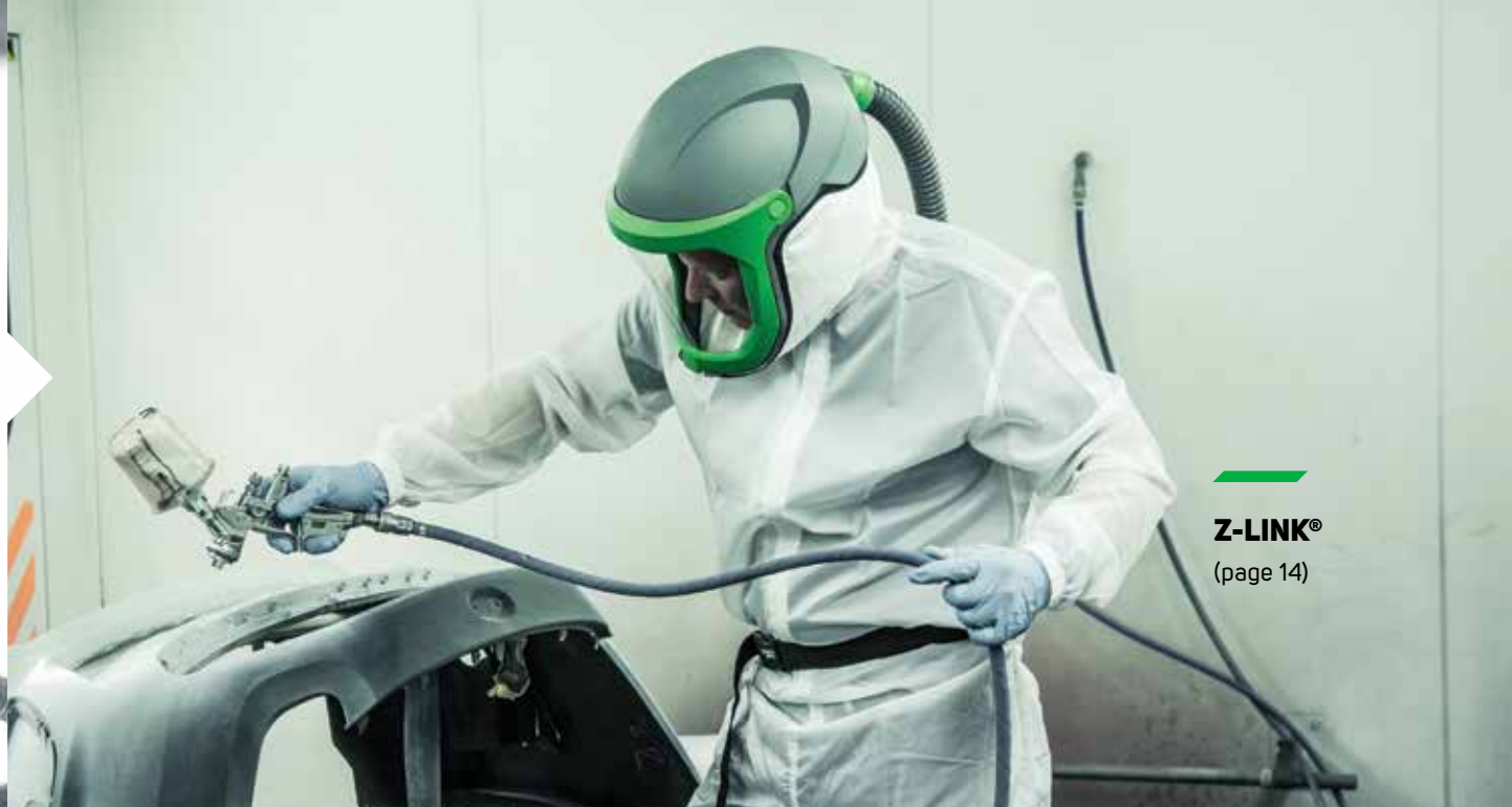
Z-LINK® (page 14)