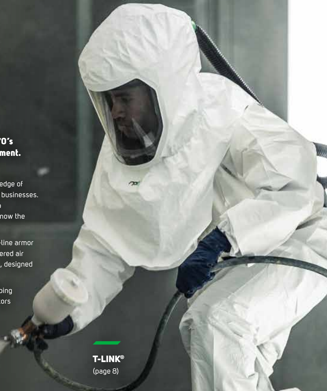
T-LINK® (page 8)