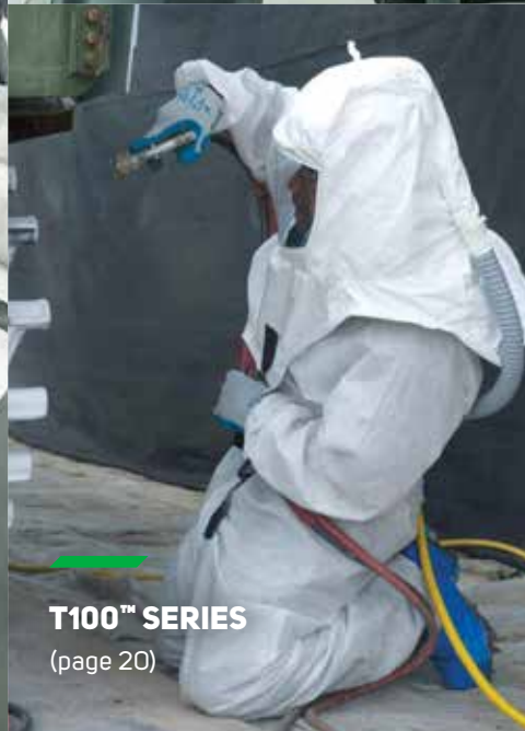
T100™ SERIES (page 20)