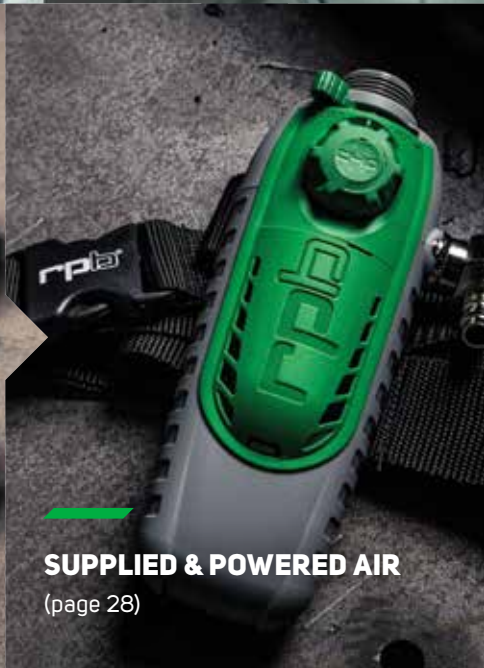
SUPPLIED & POWERED AIR (page 28)