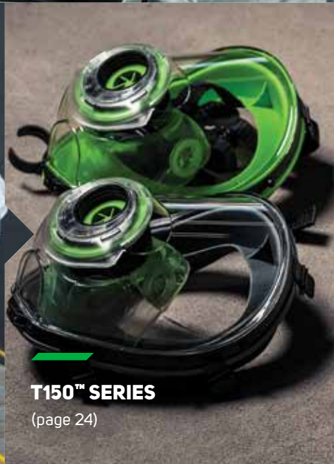
T150™ SERIES (page 24)