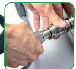
STAINLESS STEEL QUICK CONNECT