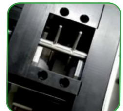
ANTI - CLOGGING SYSTEM