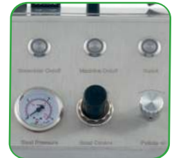
PRESSURE CONTROL, DRY ICE CONSUMPTION CONTROL