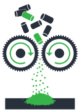
PATENTED FEEDING SYSTEM WITH SCRAMBLER