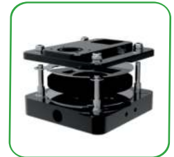
PATENTED FEEDING SYSTEM

7 m BLAST HOSE 3/4" WITH ANTI - KINK SPRING HOSE GUARD