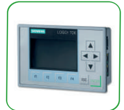
ADVANCED CONTROL MODULE